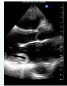
Figure 2 (right): Parasternal long axis view of the heart via ultrasound.