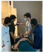
Figure 1 (left): Residents practicing carotid ultrasound imaging.